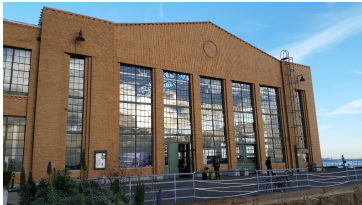
Craneway Pavillion, Richmond, California