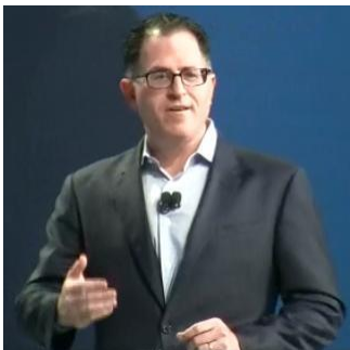
Michael Dell, CEO, Dell EMC

With themes ranging from 'why hybrid?', to 'the cloud is only as good as its network', to an 'economics crash course for senior managers', Symposium challenged panelists and participants to rethink cloud. Read more