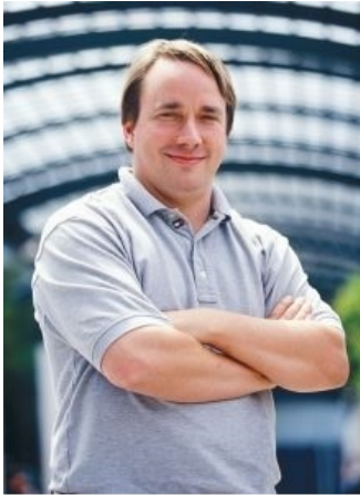
Linus Torvalds, software engineer and creator of the Linux kernel. From an interview with Linux Magazine, 2002.