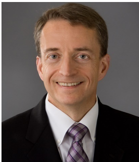
Pat Gelsinger, CEO, VMware