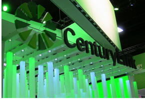
CenturyLink booth at VMworld 2017