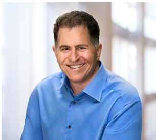
Michael Dell, CEO, Dell Technologies