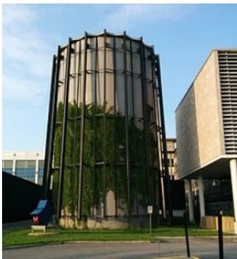
Clumeq, Université Laval, Quebec